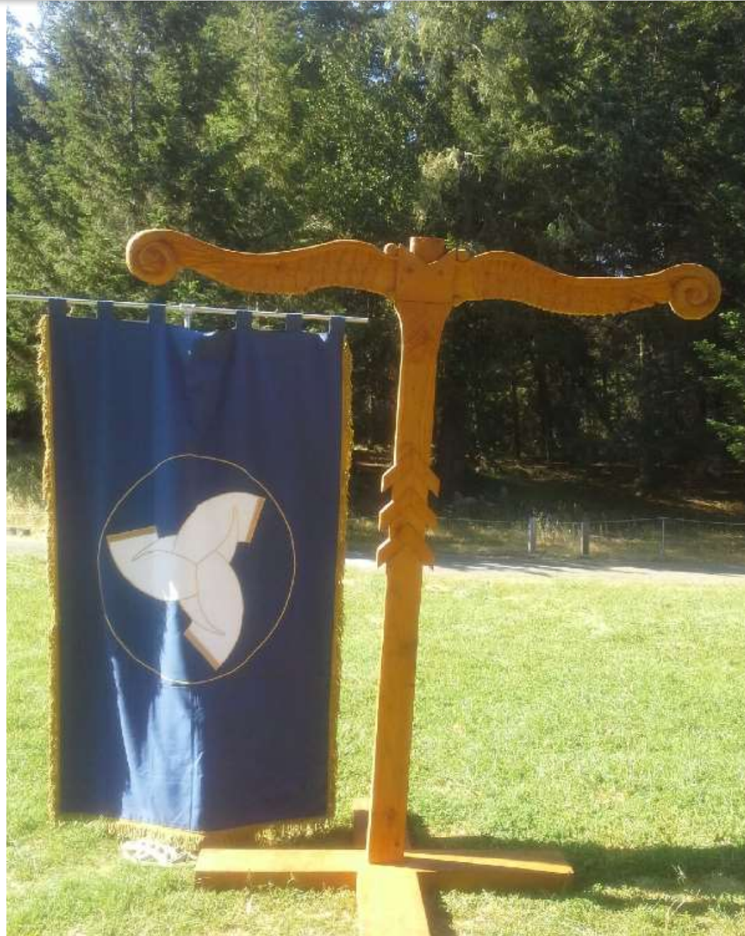
The original AFA banner you've seen in pictures over the years looked small