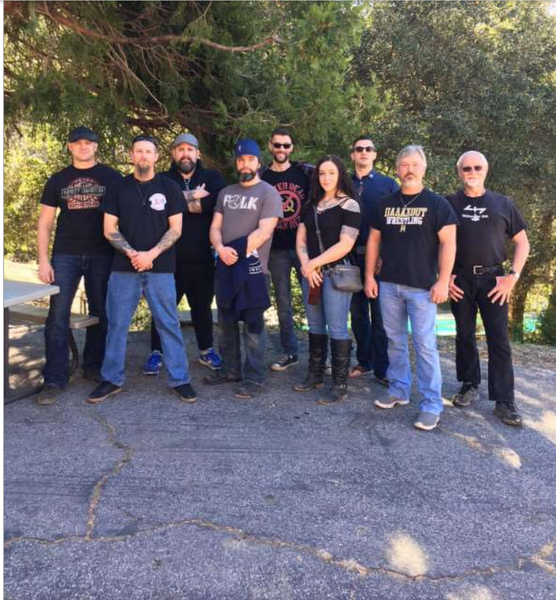
Some of our military members that made it out to the Charming of the Plow event in SoCal!