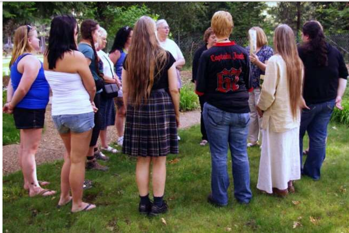
2009 Horn Blessing