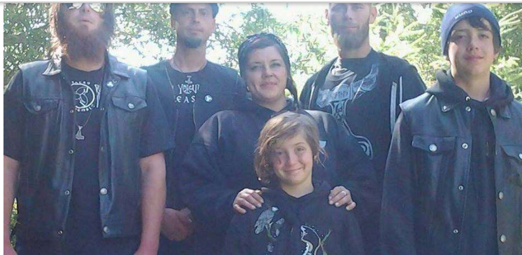
Northern California folk at the Midsummer in the Redwoods.