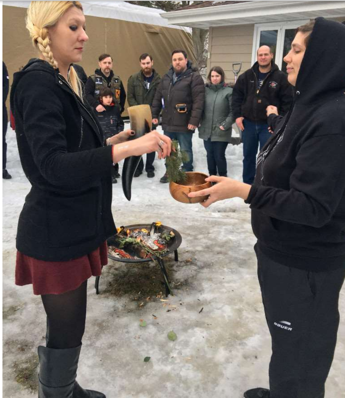
Spring is finally here and the weather is starting to get nice again. This month we are hosting our first