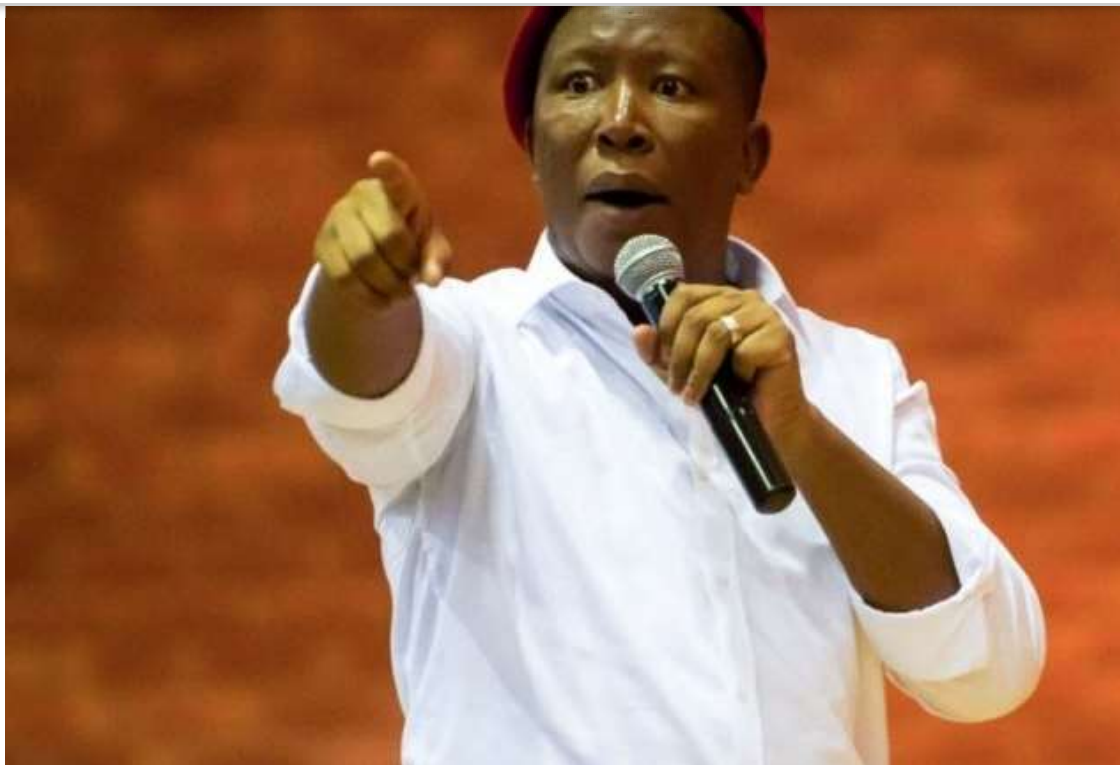
"We are cutting the throat of whiteness." Joseph Malema, South African Politician

What started out as a challenge put out to the members of my region (Australia, New Zealand and South Africa) has now turned into a fully fledged fundraising campaign supported by the Asatru Folk Assembly.