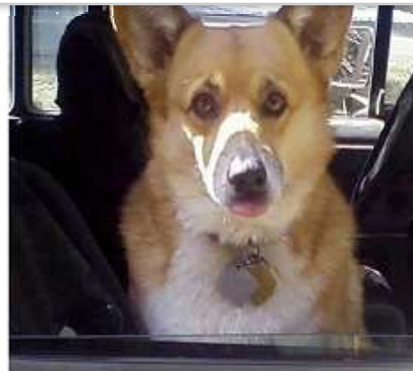
"Learn a new skill every week" – Jim and Sara the Corgi

Cellular phones are a necessity and they are a big help if you are in a big city but if you will need to flee to the desert, the network coverage will most likely be weak. Take a satellite phone with you also because you will need that to directly contact communication sites within the area.